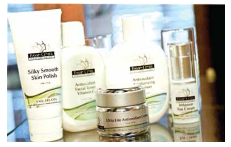
The Bassin Center for Plastic Surgery also offers a line of high-quality products to improve skin and fight aging.